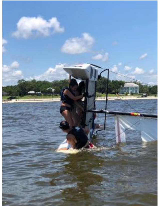
Wave righting practice