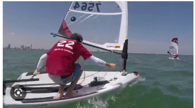
O'Pen Bic sailboats on the water ( https://www.youtube.com/watch?v=R6NkTrDM2Wk )