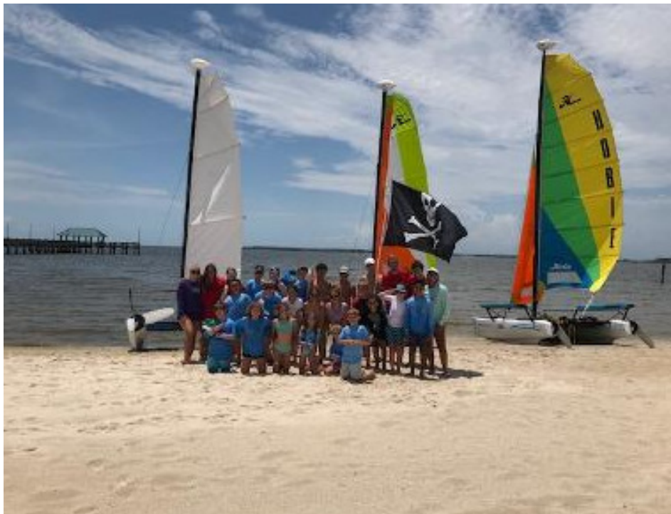
2023 Sail Camp Graduates