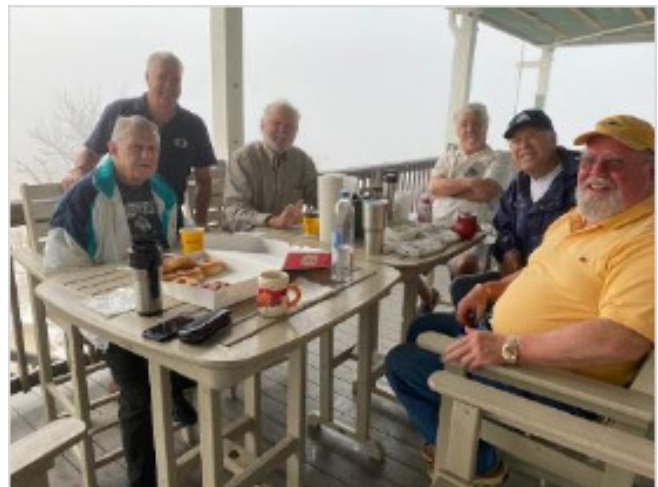
Enjoying breakfast on the Club balcony with the Vice Commodore